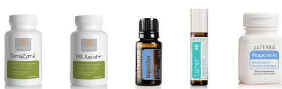
Terrazyme / PB Assist / Digestzen Tamer / Peppermint Softgels