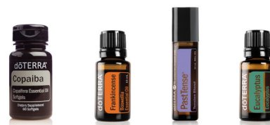
Copaiba Capsules / Frankincense Past Tense / Eucalyptus