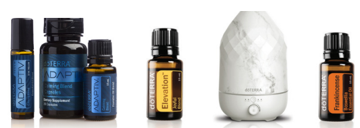
Adapativ™ Collection / Elevation Volo Diffuser / Frankincense