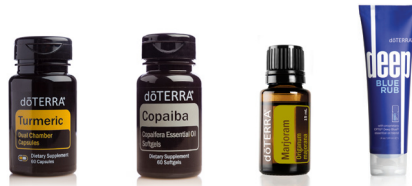
Turmeric Capsules / Copaiba Capsules Marjoram / Deep Blue Rub