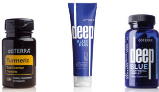
Turmeric Capsules / Deep Blue Rub Deep Blue Polyphenol Capsules